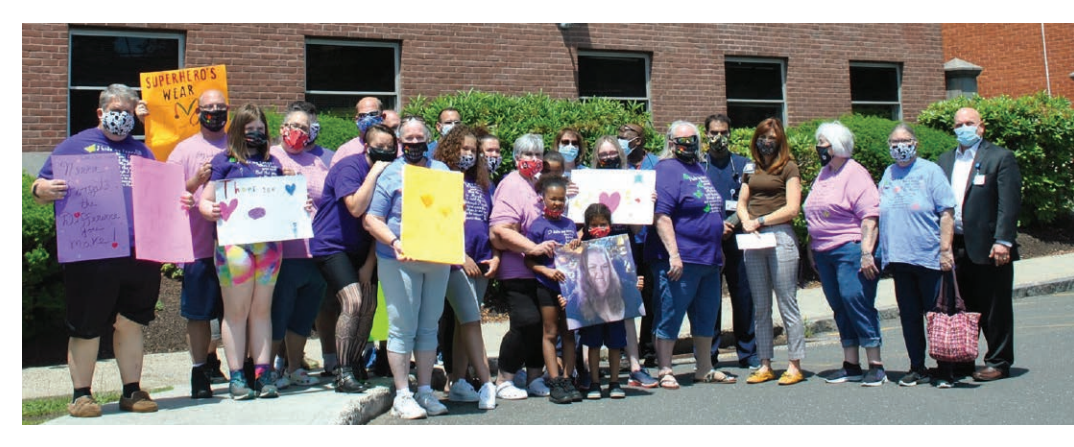
Grateful family presents gifts and thanks to Saint Mary's Hospital colleagues.

During the height of the pandemic, there was a "no visitor" policy — a difficult step in order to keep everyone safe. The