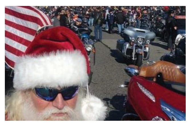
Mercy Medical Center — Hope for the Holidays Toy Run