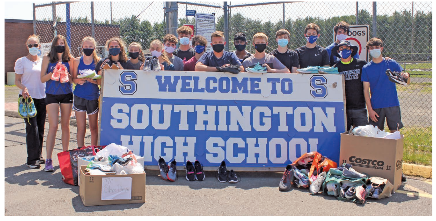
The Southington High School Track Team with the more than 60 pairs of sneakers they collected during their drive.

collected more than 60 pairs of sneakers. The kids were so excited at their success that the team promised to host an annual drive. And what goes best with sneakers? Socks — also something that patients don't always have. So, five years ago Bombas was approached to ask if they would provide socks for our patients. Their answer was an immediate yes and to date they have donated more than 13,000 pairs of socks. These donations have not only assisted our patients but have allowed us to share them with many of our community partners such as, Unity Plaza Pantry, Hartford Bags of Love, Joan C. Dauber Food Pantry, Veterans and Military Service members attending The CT Adaptive Rowing Program and golfers participating in the adaptive Golfers in Motion Program. These efforts make our communities better and our patients stronger.