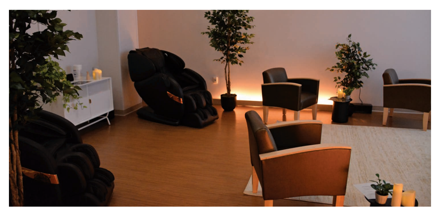
The Zen Room at Mercy Medical Center will serve as a "recharge room" for colleagues.