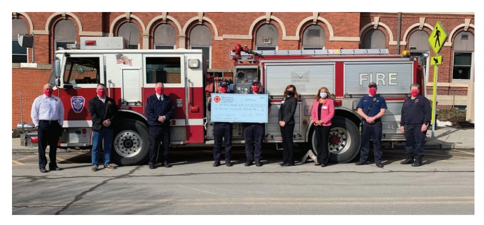
Saint Mary's Hospital - Pink Out

Third-Party Events are fundraisers hosted by grateful family members and friends whose event proceeds benefit a specific area of care most meaningful to them. During the pandemic, many hosts had to make the difficult decision to cancel their events. However, some were able to find different ways to engage their community in an effort to continue to raise funds for the hospital they care about most. These events raised almost $60,000 for our hospitals and included many gift-in-kind donations of blankets, stuffed animals, care baskets for nurses and much more. The 2022 calendar of events is starting to fill up as we move further away from the height of the COVID-19 pandemic. For information on how you can host an event or participate in one, please visit our philanthropy websites: mercygives.org; saintfrancisdonor.com; and stmhfoundation.org.