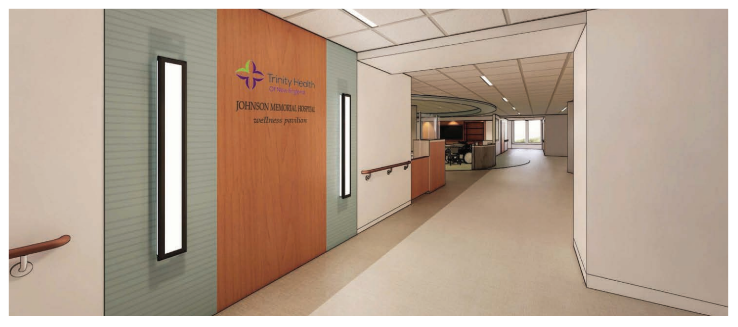
Rendering of the Geriatric Wellness Pavilion