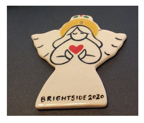
Mercy Medical Center — 2020 Brightside Angel Ornaments