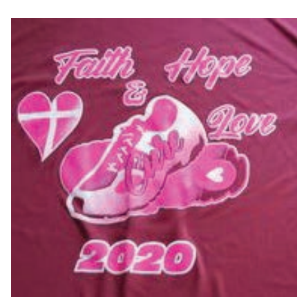
Saint Francis Hospital – Beat Breast Cancer Walk & Run