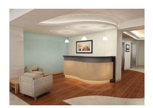
INPATIENT ONCOLOGY PAVILION RENOVATION The Pavilion will be completely transformed to create a healing environment and will be home to 20 inpatient rooms, 2 family overnight suites, a nursing station, conference area, staff respite suite, comfort and healing lounge, kitchen and integrative medicine suite.