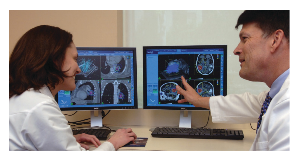
RESEARCH Clinical trials help find cures for cancer. Through our partnership with Smilow Cancer Hospital at Yale-New Haven, our patients will have the ability to participate in the most innovative clinical trials available