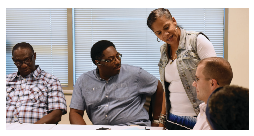
PROGRAMS AND SERVICES An essential part of our Mission is making world-class, compassionate care accessible for everyone, regardless of their ability to pay. Our patient and community funds help individuals learn about early cancer detection, prevention methods and how to survive a cancer