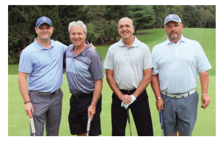
Unitex Textile Rental Services Foursome

The 24th Annual Champion Golf Classic was held at the Country Club of Waterbury. The field of 146 golfers gathered to raise over $140,000 to support Saint Mary's Hospital, including efforts to renovate the Emergency Department. Tournament Sponsor Webster Bank continued their support for the hospital and its greatest areas of need.