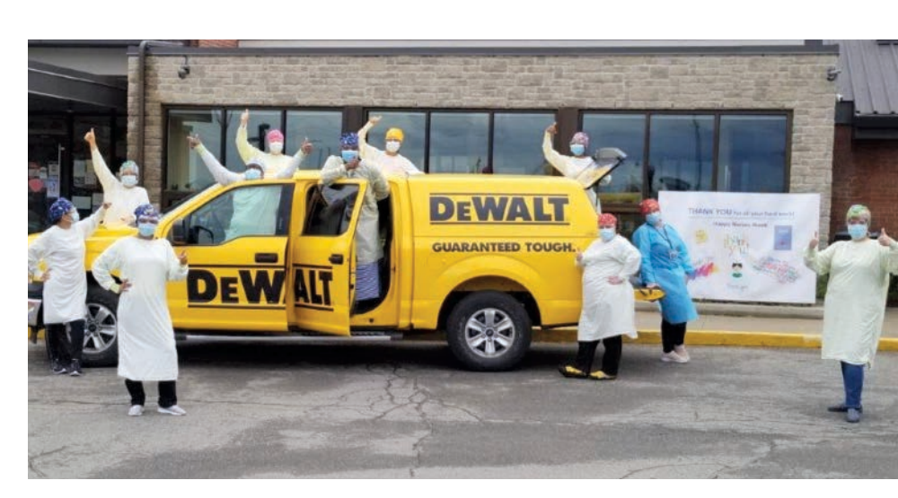
Stanley Black & Decker colleagues showing their support during Nurses' Week

To date, convalescent plasma has been administered to over 40 Trinity Health Of New England patients who were critically ill from COVID-19. The clinical trial is being conducted at Saint Francis Hospital, Saint Mary's Hospital, Johnson Memorial Hospital, and Mercy Medical Center. Patients in the trial may experience shorter hospital stays, shorter use of ventilators and shorter duration of viral symptoms.